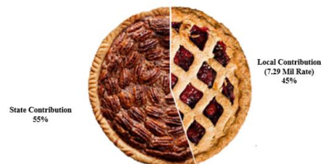
Total Cost of Education (EPS Funding Formula)

FY 24 State Appropriation for Education = $1,400,174,513 FY 24 Local Required Contribution = $1,145,097,328