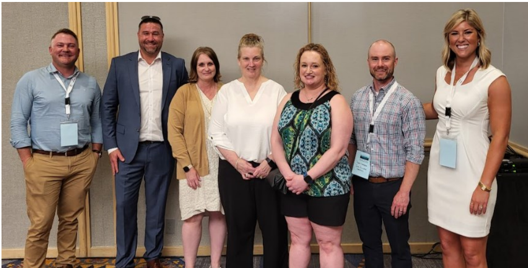
Siemens Industry Inc. awarded three $750 College Scholarships, one to a Business Official from each state for a student pursuing a STEM related field from that BA's school district.